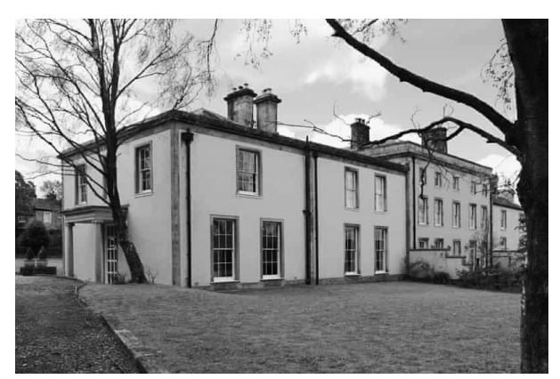
Melling Manor in Lancashire